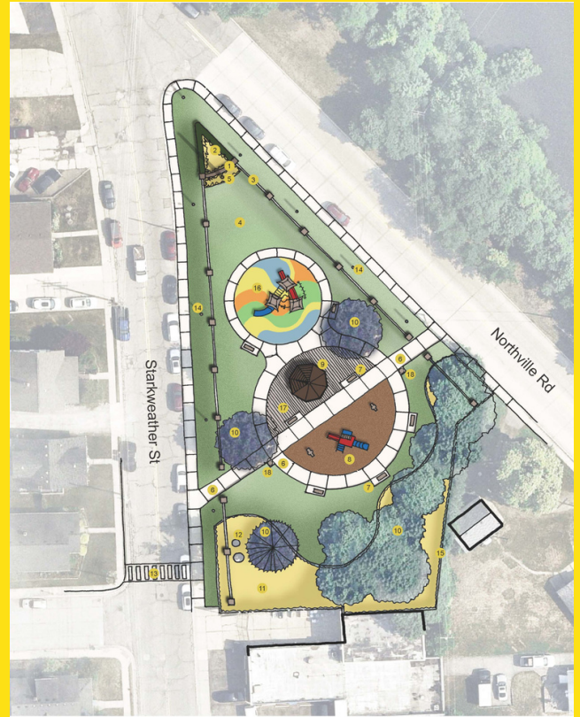
Conceptual drawing of a complete renovation of Point Park in Old Village

If the millage doesn't pass, the city will have limited funding for facility maintenance, park upgrades, and new programming and may lose the opportunity to acquire land.