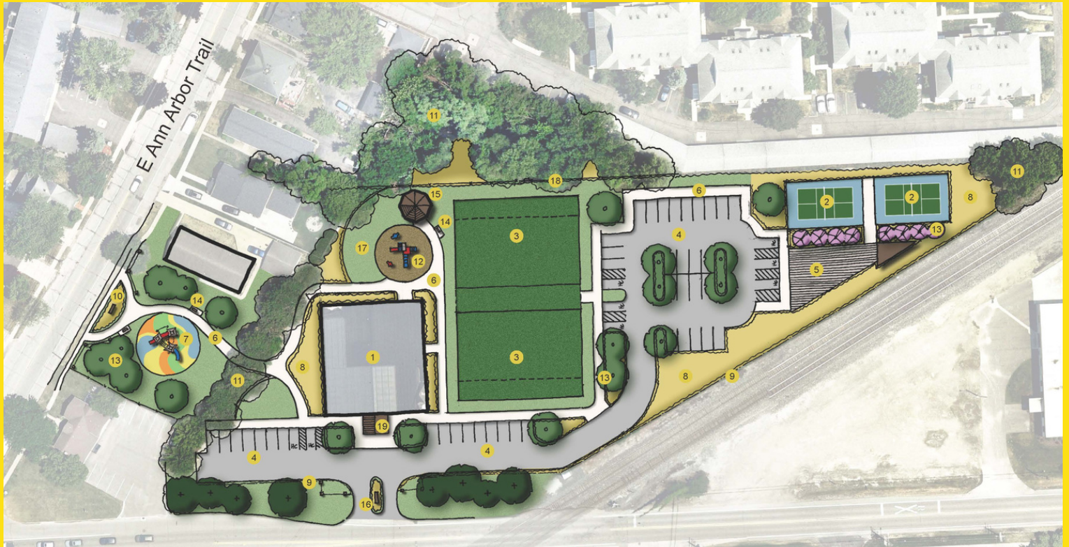
Conceptual drawing of a recreation facility at the former Lumber Mart site